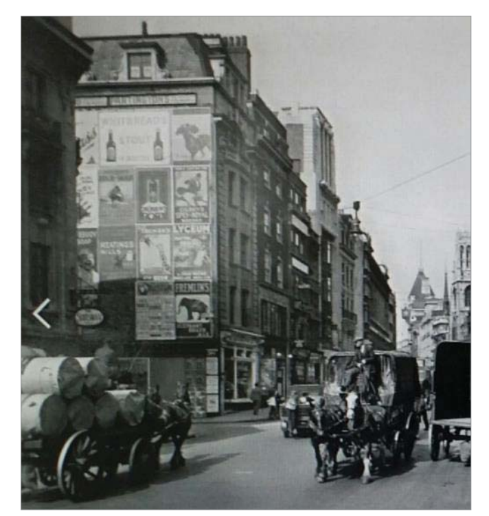
Fig. 3. Fleet Street in the 1930s (Museum of London).

Around 150 years ago, the City had one of its periodic campaigns to widen Fleet Street, and, at the same time, decided to widen the access to Bouverie Street by purchasing and demolishing 62 Fleet Street. The current building numbered 62 seems to have been built at the back of no. 61. However, the reason for the absence of windows is that the City did not need the whole site of the original no. 62. There was a strip about a foot wide which was surplus to their requirements. This strip can be seen on the ground as a separate lighter colour against the squares of the pavement. The title deed of the new 62 incorporated this strip, extending all the way to Fleet Street. Thus, the wall is not the exterior wall of no. 61, but the party wall between 61 and 62.