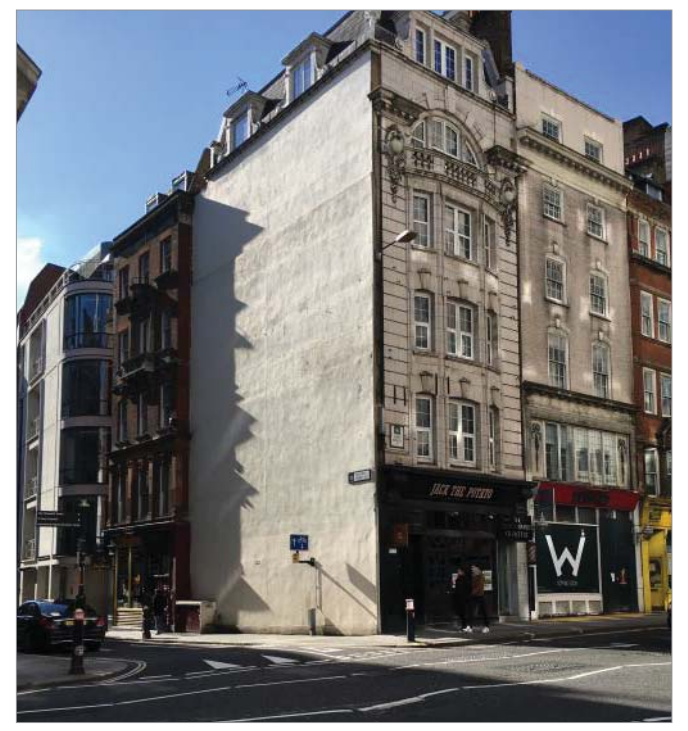
Fig. 1. The junction of Fleet Street and Bouverie Street.

It took some years to find out why there were no windows in the large blank wall. The answer was that there had originally been another building alongside the wall, covering about half of what is now the entrance to Bouverie Street. Old maps show Bouverie Street narrowing down to eight feet or so at the junction with Fleet Street (Fig. 2).